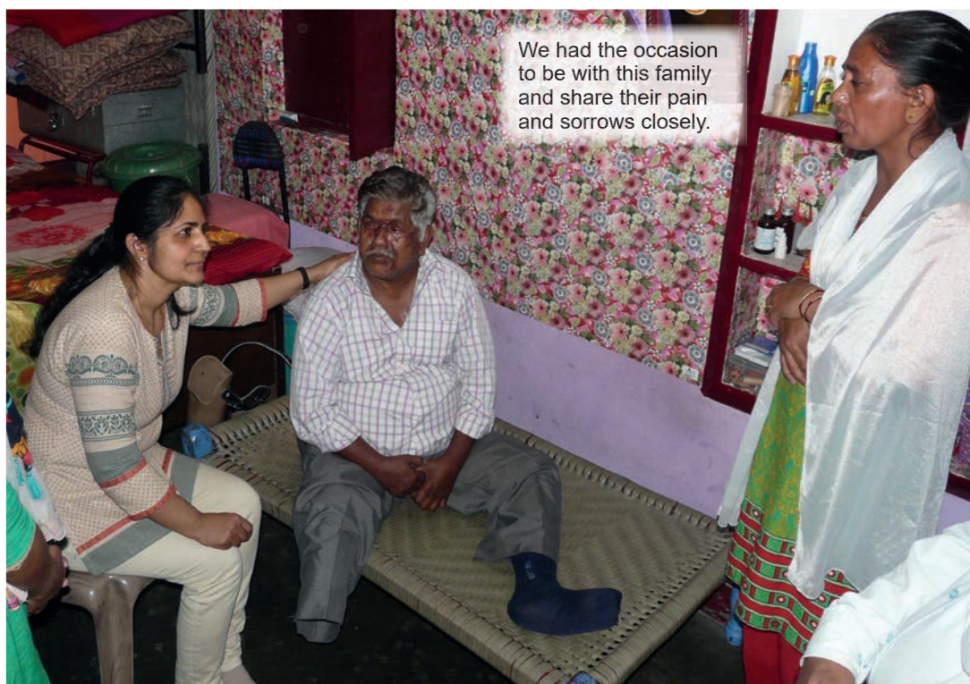
We had the occasion to be with this family and share their pain and sorrows closely.

We all wish you a Happy New Year and pray for the Blessing of God to each of you and your dear and near ones ! »