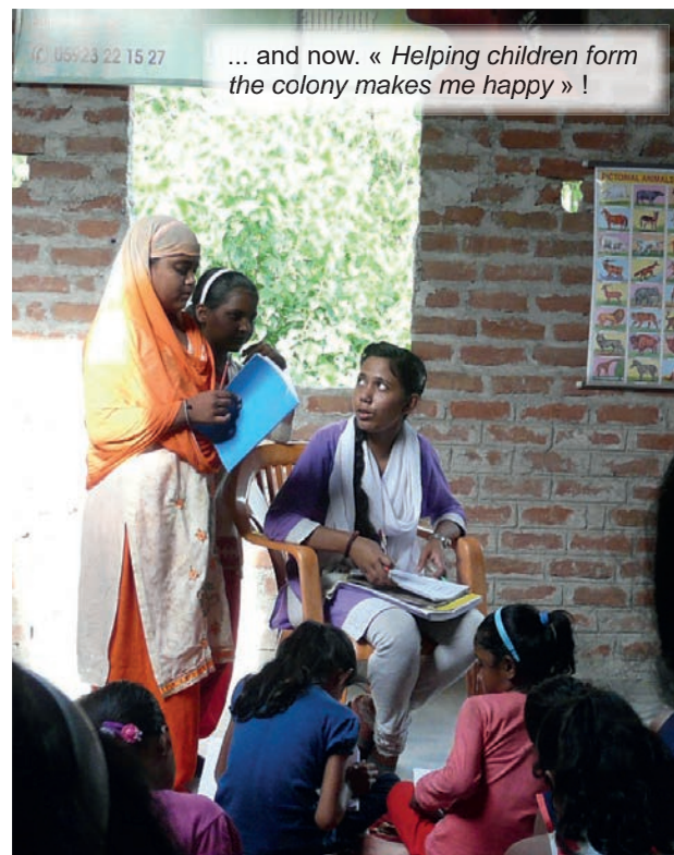
... and now. « Helping children form the colony makes me happy » !

tragedy but many supporting hands including Anthony's bread lifted us up from this too.