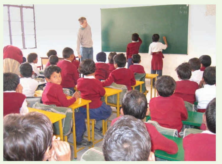
I was in Dugawar in the month of February. Seeing the children in Saint-Anthony's School growing gives a lot of strength to go ahead with the work we have taken up. Our wish is to reach out to the maximum number of those children who otherwise would be staying home.