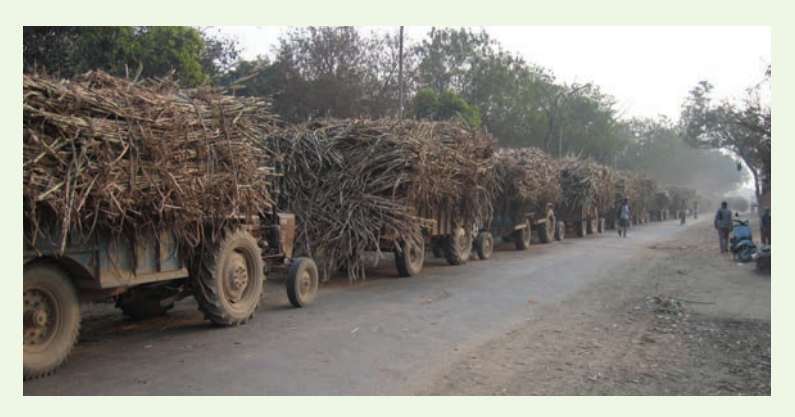
The Mill keeps the local police in their good book and police take no action whatever may come. On this picture, trucks are aligned but most of the time they completely block the road...